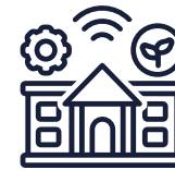
Sports & Library Facilities