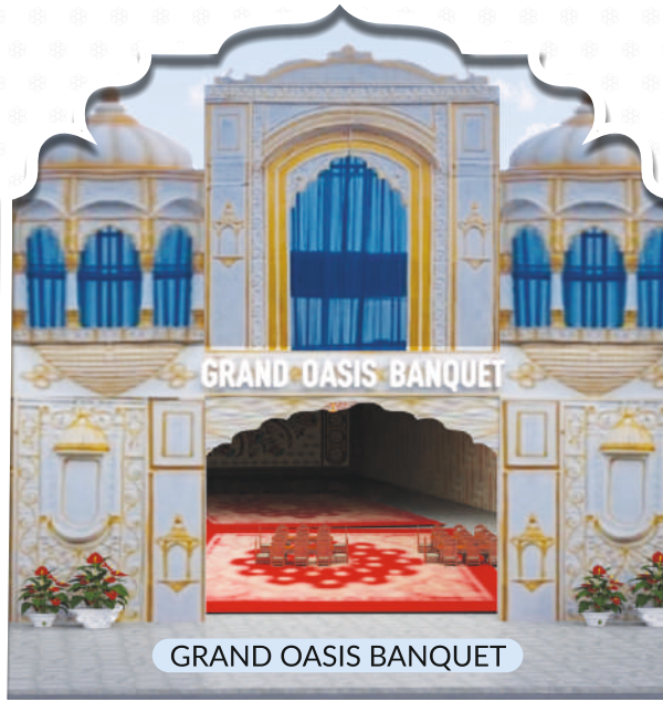
GRAND OASIS BANQUET