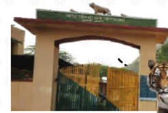
Sariska Tiger Reserve