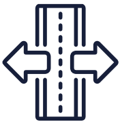
40-ft Wide Roads