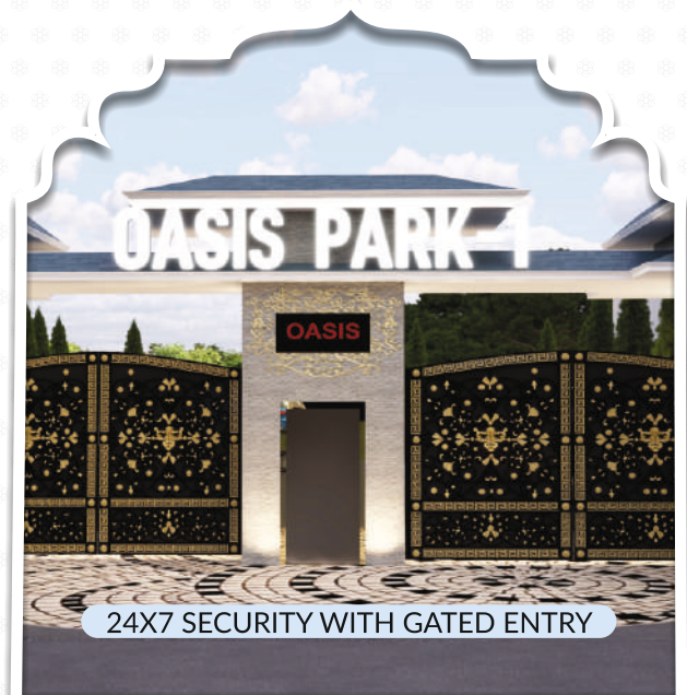
24X7 SECURITY WITH GATED ENTRY