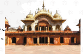
Moosi Maharani Ki Chhatri