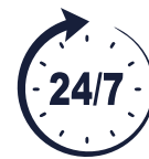
24/7 Water & Electricity