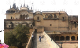
Bala Quila (Alwar Fort)