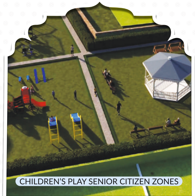
CHILDREN'S PLAY SENIOR CITIZEN ZONES