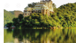
Siliserh Lake & Palace