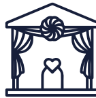
Oasis Banquet Hall