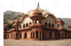
Alwar City Palace (Vinay Vilas Mahal)